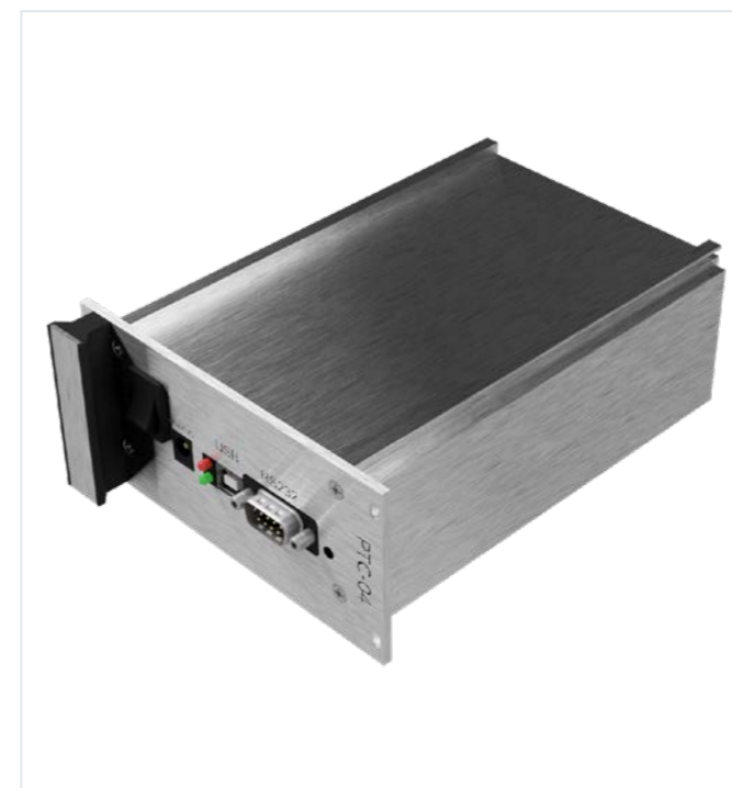
PTC-04 programming tool